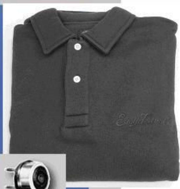
213 For garment or fabrics