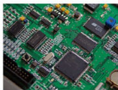
High speed CPU control circuit