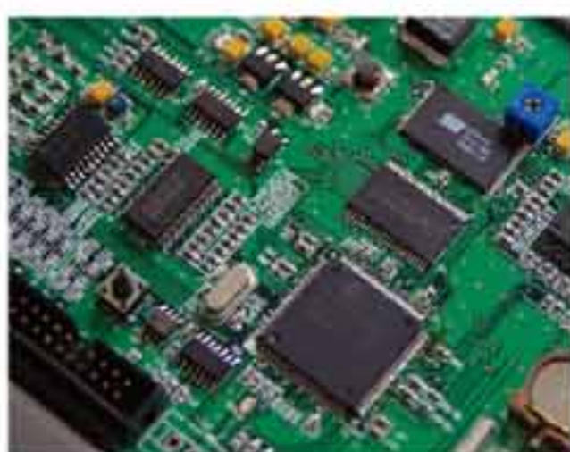
High speed CPU control circuit